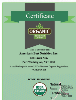
Organic Natural Food